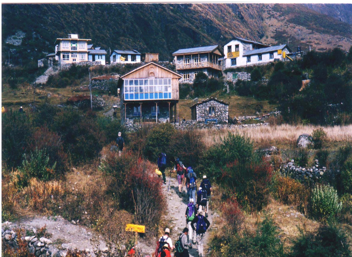
Fig.1: Langtang hotels - trekkers' first encounter with the village

business ventures, hotel operation is determined predominantly by the desire for profit and the need to design a machine for the realization of capital under the current realities of Nepal's developmental goals and the global tourism industry. This overriding concern therefore exerts a decisive instrumental control over other aspects of the hotel design, so that the hotel, while a built environment, is also a manifestation of wider discursive practices.