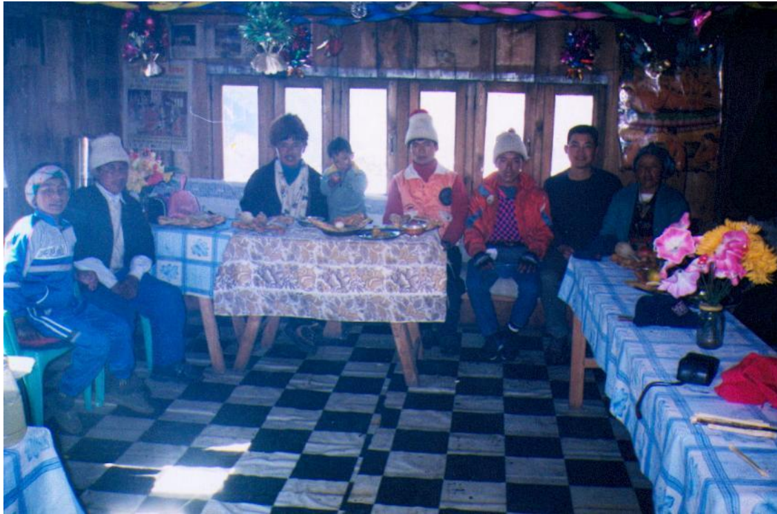
Fig. 5: Hotel's dining room as site of status generation. The host is the only person wearing the chuba reminiscent of a chieftain. Notice that, with the exception of the toddler, a young boy (ranked according to age) and a woman (ranked according to gender) are sitting furthest away from the host.