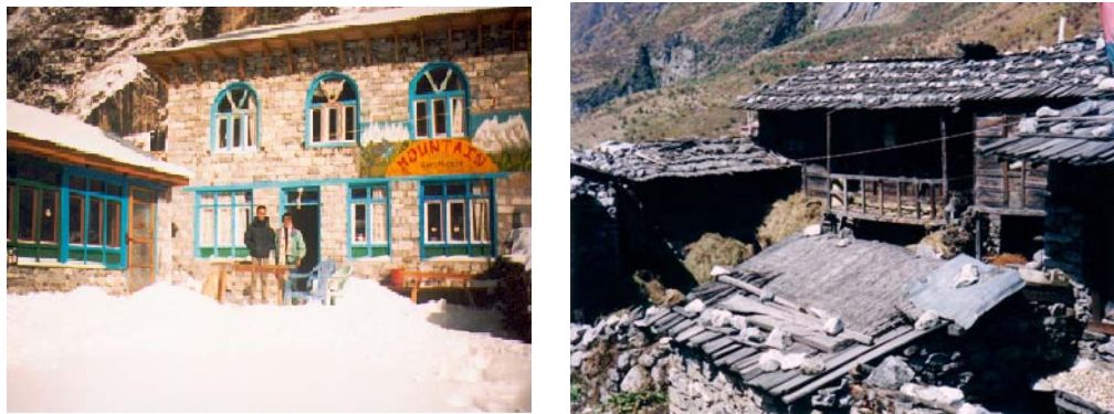
Fig. 2: New status symbol - Contrast between a hotel and a traditional house

In the above analysis, I have shown how the hotel, in order to become an effective machine for the realization of capital, assumes a specific design and contains certain essential facilities. This has resulted in an architectural form different from the traditional building style in Langtang: