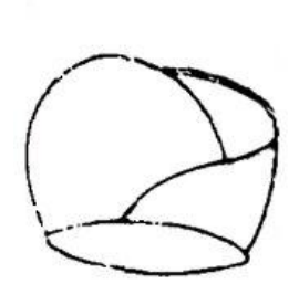
Figure 4. A lotus crown as depicted in the Ming Sancai tuhui (Clothing, Book I). The index of that illustrated encyclopedia lists it as a lotus crown (furongguan 芙蓉冠), while the text that accompanies the drawing calls it a lotus hat (furong mao 芙蓉帽). The name has been applied to other distinct headdresses including a Daoist ceremonial cap with an upturned brim of segments resembling the petals of a blooming lotus.