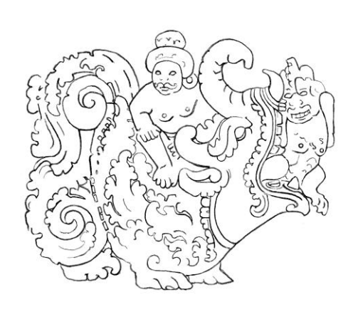
Figure 5. The makara drawn here is a detail from a 7<sup>th</sup> Century lintel found at Sambor Prei Kuk, now in the Musée Guimet. An enormous, scaleless "fish" with four feet and an elephant's trunk, it fits the description of the jian-tong in the account of Zhenla.

Figure 4. A lotus crown as depicted in the Ming Sancai tuhui (Clothing, Book I). The index of that illustrated encyclopedia lists it as a lotus crown (furongguan 芙蓉冠), while the text that accompanies the drawing calls it a lotus hat (furong mao 芙蓉帽). The name has been applied to other distinct headdresses including a Daoist ceremonial cap with an upturned brim of segments resembling the petals of a blooming lotus.