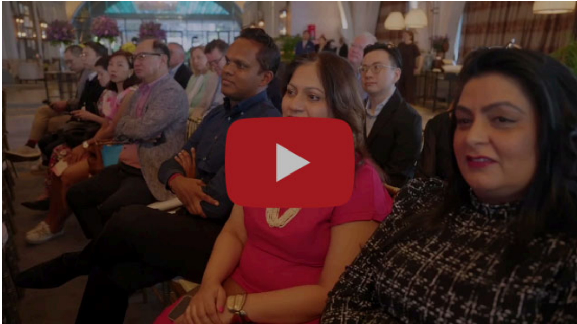
Highlights from “Can Asians Think of Peace? Essays on Managing Conflict in the Asian Century” book launch.