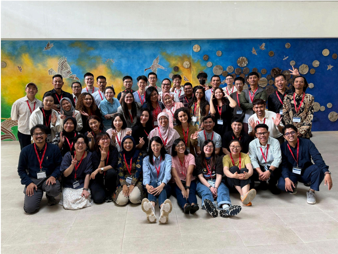
The 20th Singapore Graduate Forum on Southeast Asian Studies cohort.