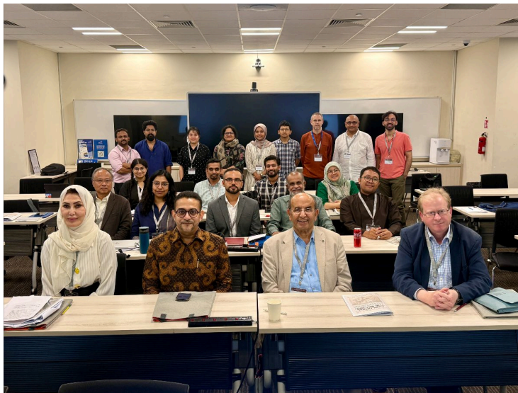
Group photograph of conference presenters and discussants.

The Muhammad Alagil Chair in Arabia Asia Studies organised an international conference and a lecture on the 4th and 5th of December 2025. Exploring the Sacred: People, Place and Power in the Islamic Indian Ocean was the eighth conference in a series begun in 2014, and opened novel themes and revised our thinking on key topics. Sufi textual, performative, and devotional work was a major theme that presenters explored anew by focusing on transregional sacred sites, rituals, health care, and wellbeing. Presenters also upended prevailing views about sovereignty, authority, and flows of Islamic knowledge, among other things, by showing how debates that arose in the seventeenth-century Malay world influenced scholarly production in Mecca and Egypt. Sixteen presenters based in Saudi Arabia, United Arab Emirates, India, Singapore, Indonesia, United Kingdom, France, United States and Canada came together to form a lively intellectual community with plans for ongoing collaboration.