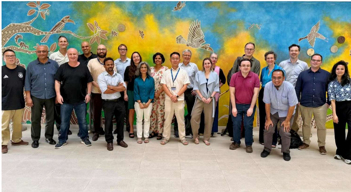
Delegates at the Global Indo-Pacific Symposium, 9-12 February 2026, Singapore.

The Max Weber Foundation’s research node on 'Global Indo-Pacific: Connecting Histories and Futures' hosted the Global Indo-Pacific Symposium on 9–10 February. The event explored the Indo-Pacific’s complex history, spanning from the east coast of Africa to the